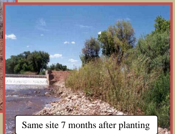
Same site 7 months after planting